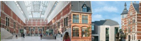
The Stedelijk renovation and extension ( http://www.inexhibit.com/case-studies/stedelijk-renovation-extension/ )