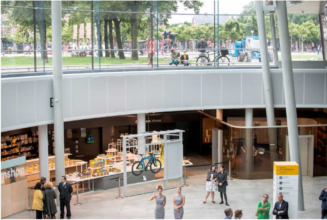
( http://www.inexhibit.com/wp-content/uploads/2015/09/van-gogh-entrance-inside-01.jpg )