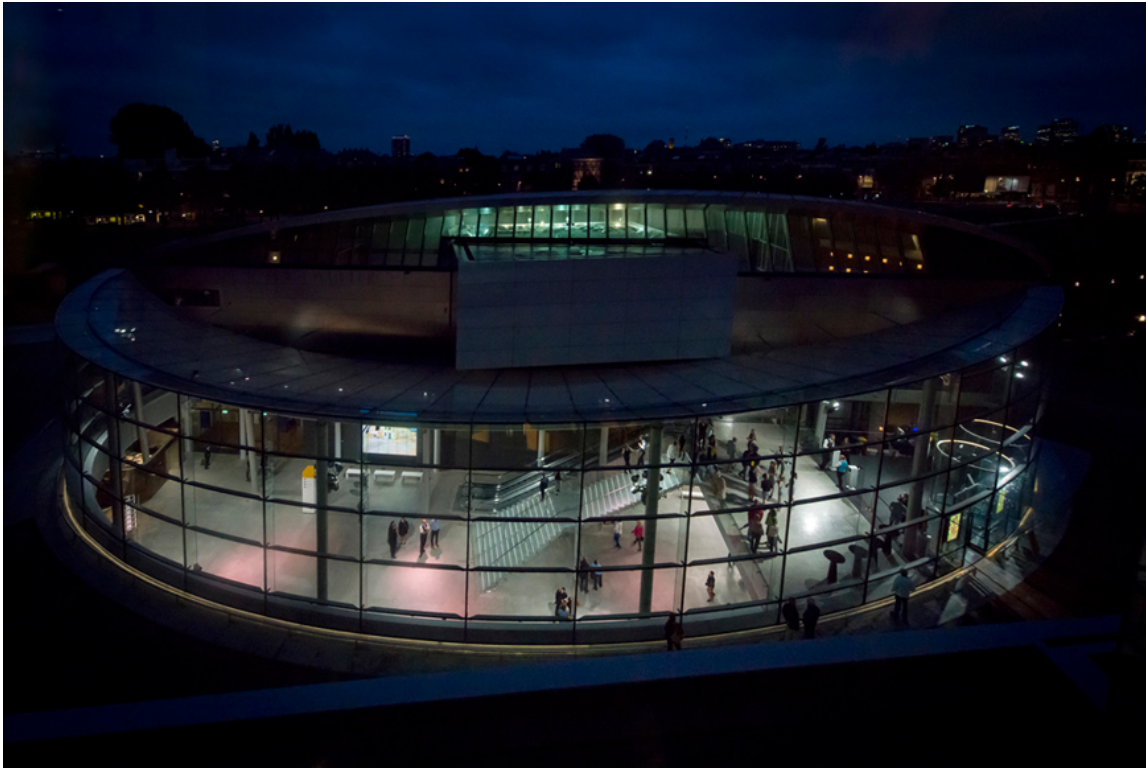
( http://www.inexhibit.com/wp-content/uploads/2015/09/van-gogh-entrance-night-02.jpg )

By a large stairway, also made in glass, or a panoramic elevator, the visitors reach an underground lobby – 16 feet below the street level – that accommodates the museum's reception areas and visitor service facilities, including a cloakroom and new museum store. The lobby gives access to the two main gallery wings of the Van Gogh museum.