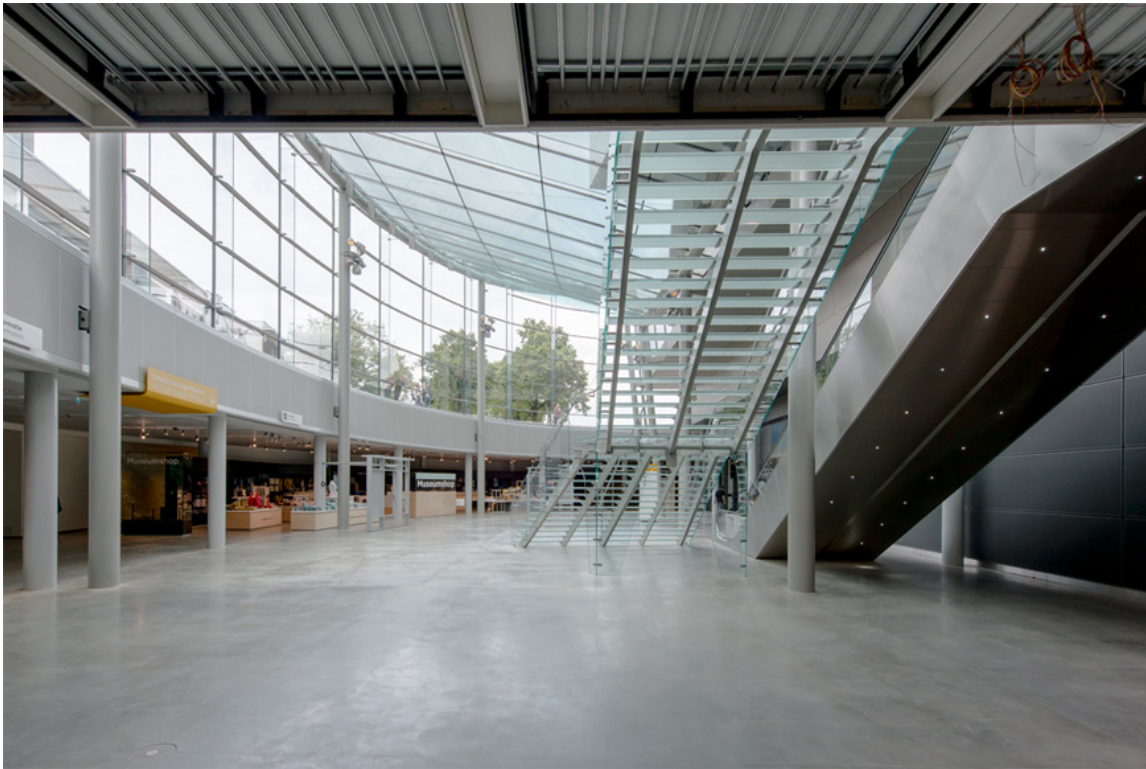
( http://www.inexhibit.com/wp-content/uploads/2015/09/van-gogh-entrance-inside-02.jpg )